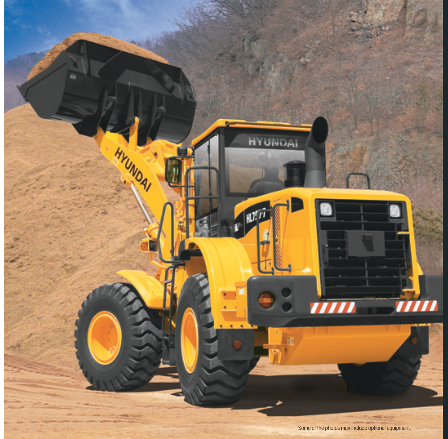
Some of the photos may include optional equipment.

HYUNDAI WHEEL LOADER Applied Tier 2 Engine